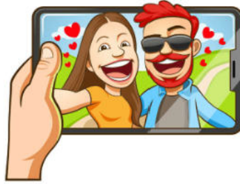
A Parent's Guide to Sharing Pictures