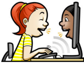
A Parent's Guide to Social Media