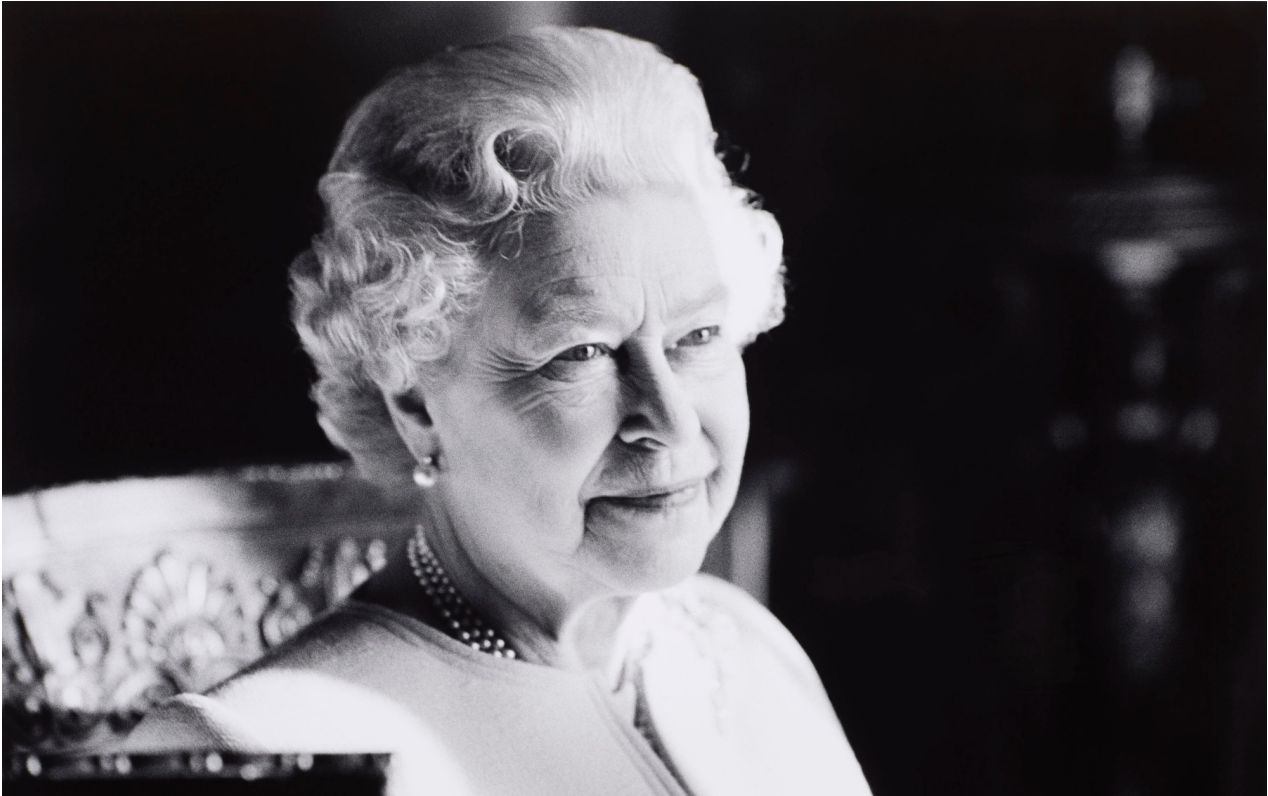
Her Majesty Queen Elizabeth II 21 April 1926 to 8 September 2022