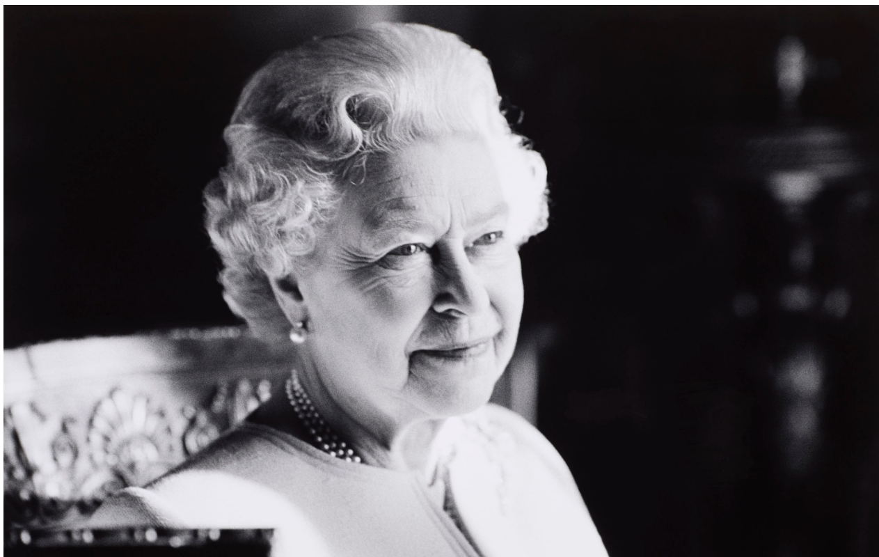
Her Majesty Queen Elizabeth II 21 April 1926 to 8 September 2022